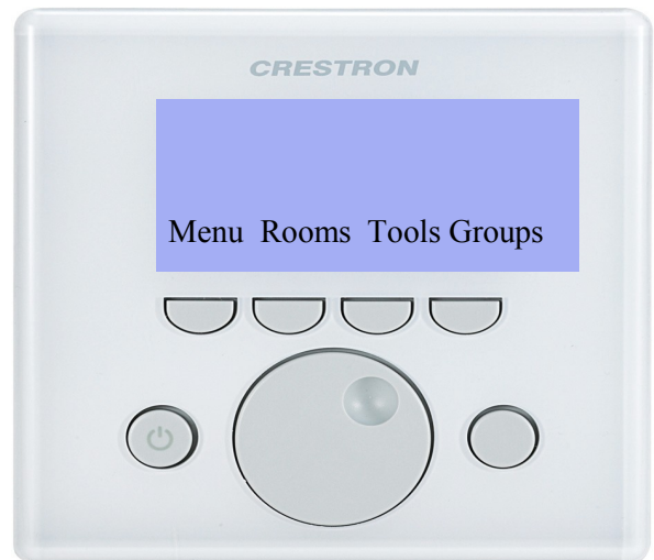
If you press the Other button the above options appear