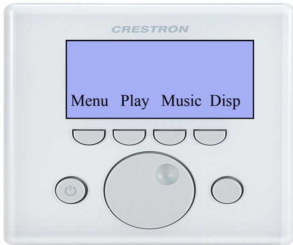
If you Press Control the above options appear